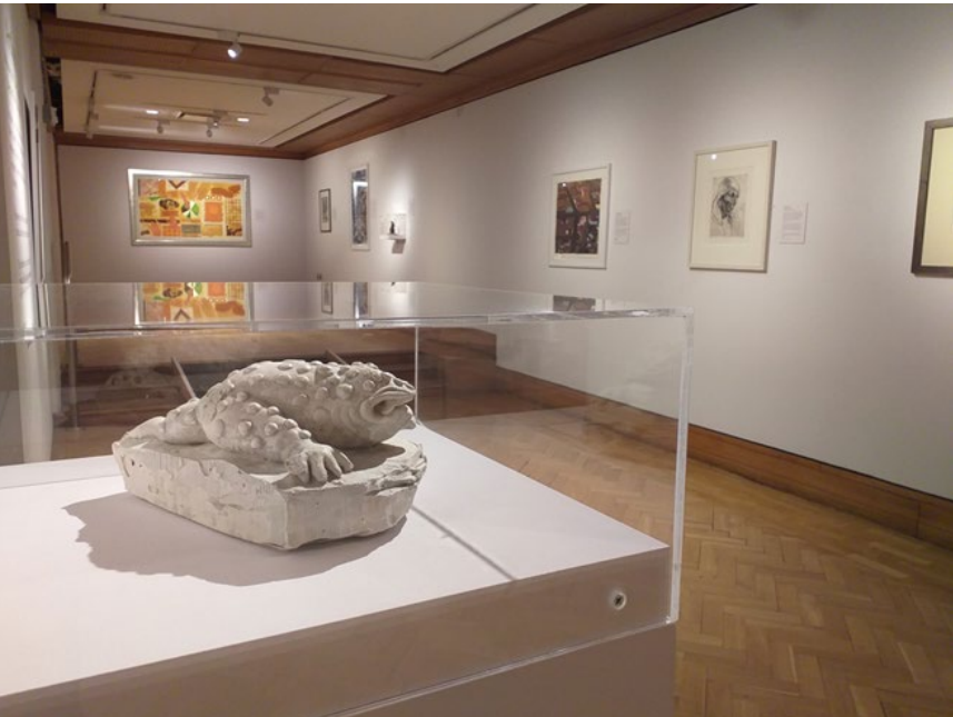
Eduardo Paolozzi, Puchan , plaster maquette, 1988 (on display at City Art Centre)