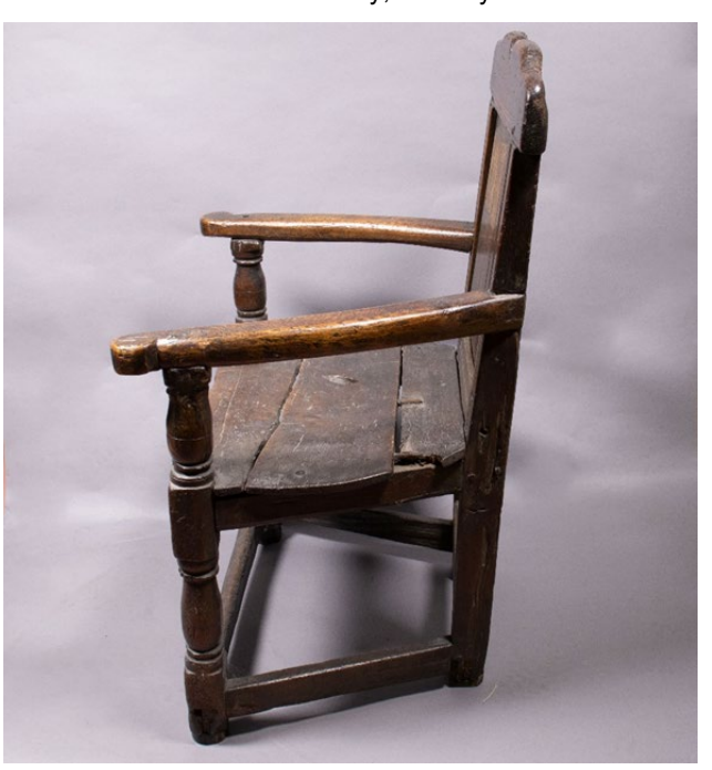
Photograph of 15<sup>th</sup> century linked to Cardinal Beaton taken, processed and recorded at the Collections Centre by project team