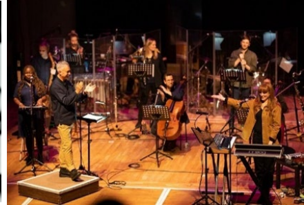
Kae Tempest - 23 April