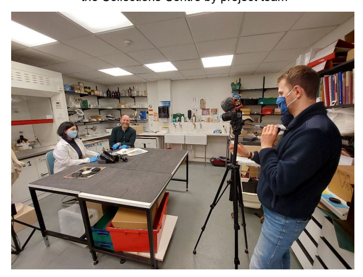
Filming for an online practical workshop on plastics