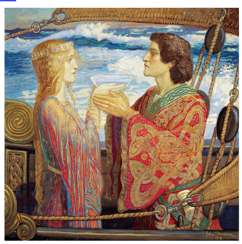
John Duncan, Tristan and Isolde, 1912. City Art Centre, Museums and Galleries Edinburgh.

National Treasure: The Scottish Modern Arts Association is presented as part of Edinburgh Art Festival 2022. The exhibition opens on 21 May and runs until 16 October 2022. For visitor information see: <a href="https://www.edinburghmuseums.org.uk/whats-on/national-treasure-scottish-modern-arts-association">https://www.edinburghmuseums.org.uk/whats-on/national-treasure-scottish-modern-arts-association</a>